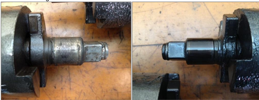
Dry - Lack of Lubrication

Remove hammer case and inspect anvil. In the photos below, the dry anvil is on the left and the correctly lubricated anvil is on the right: